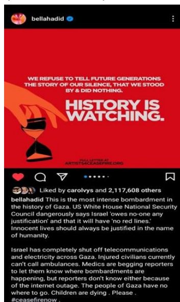
Figure 3. Bella Hadid posted support for Palestine on Instagram