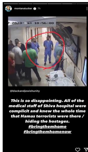
Figure 7. Montana Tucker posted support for Israel on Instagram