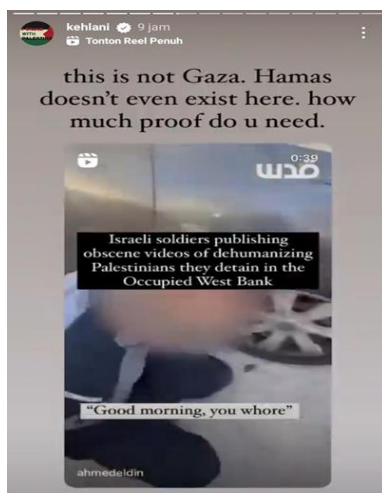
Figure 2. Kehlani Ashley Parrish posted support for Palestine on Instagram

Figure 1. Kehlani Ashley Parrish's Instagram profile photo shows support for Palestine On 15th October 2023, Kehlani updated her Instagram profile picture with an image featuring the Palestinian flag. Alongside the flag, the profile picture contains a caption that states, "I stand with Palestine." This act indicates Kehlani's unwavering support for the Palestinian state and its struggles. Kehlani is among the few celebrities in Hollywood who have shown no hesitation in expressing their support for Palestine, and she has exhibited this support through her Instagram posts. Using the Palestinian flag in her profile picture is a powerful declaration of her solidarity with Palestine.