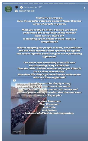
Figure 4. Aurora Aksnes posted support for Palestine on instagram

Aurora Aksnes is among the famous Hollywood celebrities who have voiced their opinions on the Israeli-Palestinian conflict through social media accounts. Aurora also uses her Instagram account to express her views on the conflict, though her profile picture does not hold any special meaning or convey a particular message. She uses her picture as her Instagram profile photo without any specific goal to achieve. However, Aurora stands firmly with Palestine and expresses her support by uploading Instagram stories and posts on her Instagram feed.