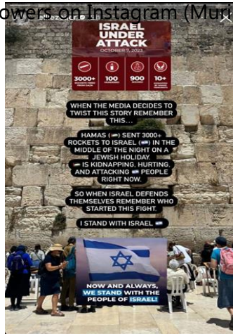
Figure 6. Ellie Zeiler posted support for Israel on Instagram

basketball and golf and directed school television programs. Then in March 2020, Ellie began actively creating content on TikTok. As a result, Ellie amassed more than 2 million followers in just a month. As of March 2022, Ellie has amassed over 10.5 million followers and over 347 million likes. Ellie also has 1.8 followers on Instagram (Murihthii, 2022).