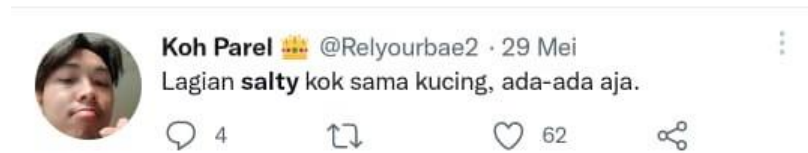
Figure 4. An example of “salty” word usage.