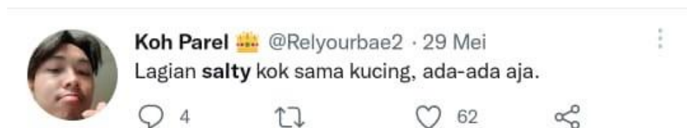
Figure 1. Source: From Twitter by Koh Parel. Downloaded on 23 rd December 2022.

Social media is one thing that is quite important for society, almost everyone uses the internet and social media, such as Twitter, Instagram, Facebook, etc. Through the social media people can post photos or videos with captions or just share some written sentences using both formal and informal language, some social media users post using informal language or slang. One of the samples is Koh Parel who likes posting his caption informal language.