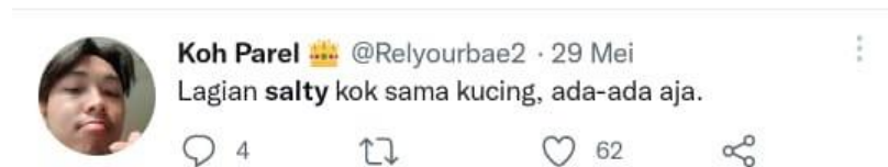
Picture 4. An example of “salty” word usage. Source: from Twitter by Koh Parel. Downloaded on 23 rd December 2022.

The third frequency of slang language there is three types. They are imitative, compounding, and clipping. Not only the frequency, but they also have the same percentage. They have just one word and 1,425 percent. An example of imitative is “Crush” this word uses English vocab that has a different meaning in Indonesia. Indonesian people use this word to describe someone that they like or who has a feeling of interest in someone. Crush in basic meaning is compress or squeeze forcefully. Below is an example of “crush” word usage :