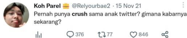
Figure 5. An example of “crush” usage

The third frequency of slang language there is three types. They are imitative, compounding, and clipping. Not only the frequency, but they also have the same percentage. They have just one word and 1,425 percent. An example of imitative is “Crush” this word uses English vocab that has a different meaning in Indonesia. Indonesian people use this word to describe someone that they like or who has a feeling of interest in someone. Crush in basic meaning is compress or squeeze forcefully. Below is an example of “crush” word usage :