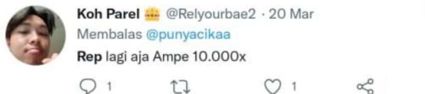
Figure 2.

Nowadays, social media has been a new lifestyle among teenagers, they can have circle who have similar hobbies, interests, work, and others. Through social media users can post on some medias freely and use informal language as well, one of the most popular social media is twitter so that the writers focus on analysing some posts on Twitter. Moreover, Twitter is used by scholars, student, professionals and others, they share content in written form and to shorten their writing, they usually use slang whether it is an acronym or a new word.