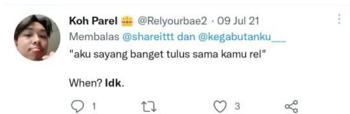
Picture 3. An example of “idk” usage.

Koh Parel uses Idk which means the phrase I don't know. Idk is often used in informal communication, like via messages on social media. There are no rules for writing Idk use uppercase or lowercase letters. An example of idk word usage would be shown below :