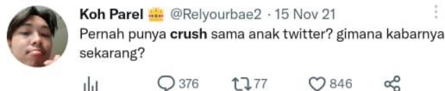
Picture 5. An example of “crush” usage Source: from Twitter by Koh Parel. Downloaded on 23 rd December 2022.

The third frequency of slang language there is three types. They are imitative, compounding, and clipping. Not only the frequency, but they also have the same percentage. They have just one word and 1,425 percent. An example of imitative is “Crush” this word uses English vocab that has a different meaning in Indonesia. Indonesian people use this word to describe someone that they like or who has a feeling of interest in someone. Crush in basic meaning is compress or squeeze forcefully. Below is an example of “crush” word usage :