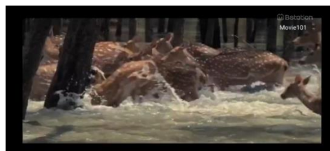
Figure 12. Animal