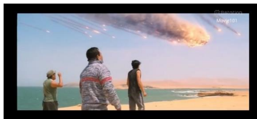
Figure 6. Apocalypse

In the figure above, the comet's descent towards Earth after the failure of the BASH and United States Government's rescue project highlights the apocalypse concept from Greg Garrard's ecocritical theory. This event underscores human vulnerability and our dependence on the environment, while also illustrating the potential for catastrophic disasters that threaten Earth's survival. By explicitly linking Garrard's theory to the film's narrative, we see how the film reflects these theoretical concepts. The comet's impact not only symbolizes the dangers of ignoring ecological issues but also emphasizes the urgent need for humanity to take responsibility and act to protect our planet. The narrative, with its portrayal of failed rescue efforts and their dire consequences, directly ties into Garrard's ideas about ecological responsibility and the risks of environmental neglect.