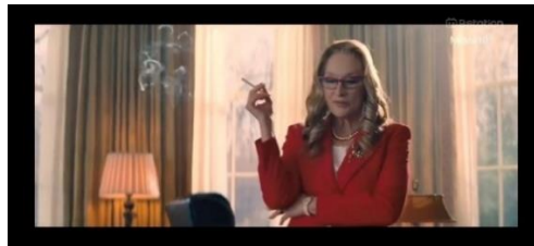
Figure 1. Pollution

In Don't Look Up , President Orlean's decision to smoke indoors exemplifies Greg Garrard's concept of "pollution" in ecocritical theory. The act of smoking not only introduces harmful chemicals like nicotine, tar, and carbon monoxide into the immediate environment but also reflects a broader disregard for the health and well-being of others, a key theme in the film. Orlean, as a central political figure, symbolizes those in power who contribute to environmental degradation through their careless actions. Her behavior mirrors the larger narrative of political apathy toward ecological issues, aligning with Garrard's view that pollution results from human activities that exceed environmental limits and pose significant risks to both nature and human health. This scene, through Orlean's casual negligence, highlights how those in authority ignore the environmental consequences of their actions, further emphasizing the film's critique of political irresponsibility toward environmental crises.