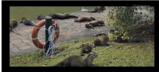
Figure 13. Animal