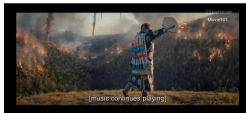
Figure 4. Wilderness

In the context of Greg Garrard's ecocritical theory, the forest scenes in Don't Look Up can be interpreted as visual representations of the wilderness concept. According to Garrard, wilderness represents a pristine, untouched state of nature, largely free from human interference. In the film, these forest scenes symbolize one of the last remaining refuges of wild nature. However, the narrative contrasts this natural purity with human-caused environmental destruction, such as the comet threatening Earth. By linking these wilderness scenes to the broader storyline, the film highlights humanity's disconnection from nature and the imminent danger posed by ignoring environmental issues.