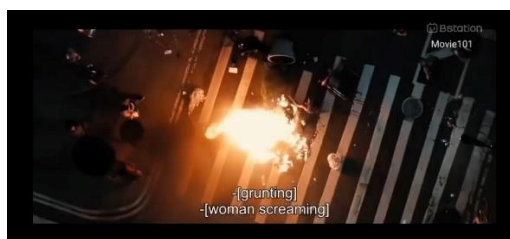
Figure 7. Apocalypse

The above data illustrates a scene of chaos in the streets where people are fleeing in panic due to the meteor's impact. In the context of Greg Garrard's ecocritical theory, this depiction of chaos and its effects on public facilities can be understood through the apocalypse concept, as it demonstrates the widespread disintegration of social structures. This scene reflects how apocalyptic events can lead to significant damage to critical infrastructure and public order.