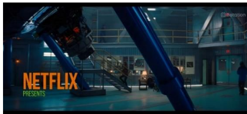
Figure 8. Dwelling