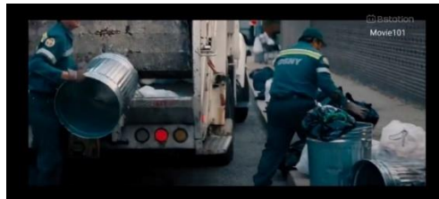
Figure 2. Pollution

In the movie, the scene showing a janitor cleaning up a pile of garbage on the roadside represents Greg Garrard's idea of "pollution" from his ecocritical theory. This scene shows how human actions, like poor waste management, can pollute the soil and water, upsetting the natural balance. The pollution shown here connects to the film's larger message about environmental damage. It also relates to how the characters, especially those in power like President Orlean, show little concern for the environment. This reflects Garrard's point that pollution is not just an environmental issue but also a sign of unfairness in society.