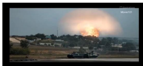
Figure 5. Apocalypse