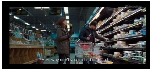
Figure 10. Dwelling

In the context of Greg Garrard's ecocritical theory, the supermarket where Kate, Dr. Mindy, and Yule are shopping represents the concept of dwelling. It serves as a setting where individuals interact with the environment through their consumption practices, reflecting their daily living and relationship with natural resources (Garrard, 2004).