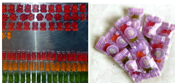
Figure 1. Organoleptic Evaluation