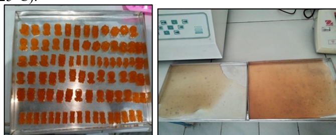
Figure 2. Microgum Preparations Before and After Accelerated Stability Testing

Following storage at 40°C, all formulations exhibited physical changes, including softening and deformation. In contrast, all formulations maintained their physical characteristics during storage at room temperature (25°C).